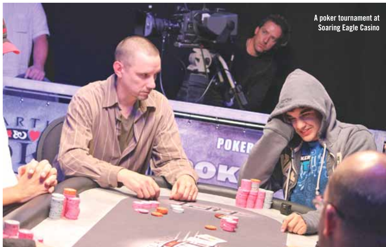
A poker tournament at Soaring Eagle Casino

Rick Springfield March 26-27, 8 p.m., $32