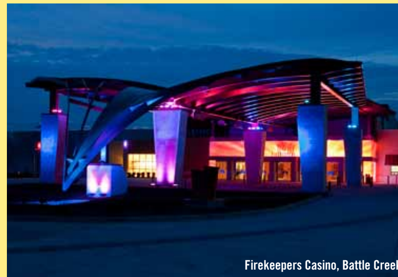
Firekeepers Casino, Battle Creek

Kewadin Casino - Hessel 3 Mile Road Hessel (906) 484-2903 kewadin.com